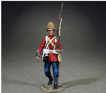
50131C $46 24th Foot in Full Marching Kit, 1879