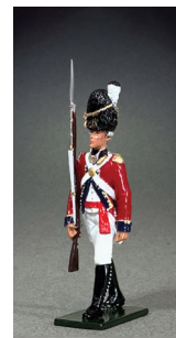
50129C $28 Coldstream Guards Grenadier Officer Marching, 1792 Glossy Figure