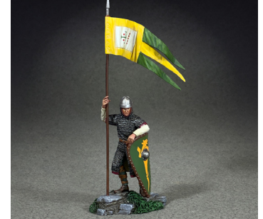
50092C $52 Norman Knight with Banner, 1066