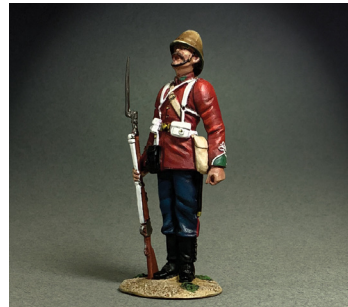
50121C $46 24th Foot Answering Roll Call, 1879