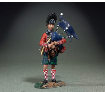
50123C $50 42nd Royal Highland Regiment Pipe Major, Grenadier Company, 1758-67