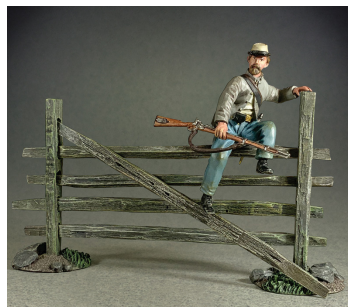
50120C $60 Up and Over Confederate Climbing Split Rail Fence