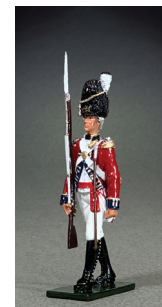
50128C $28 Coldstream Guards Grenadier NCO Marching, 1792 Glossy Figure