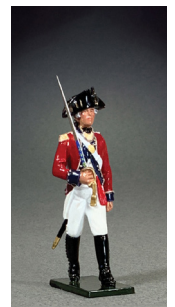
50130C $28 Coldstream Guards Battalion Coy Officer Marching, 1792 Glossy Figure