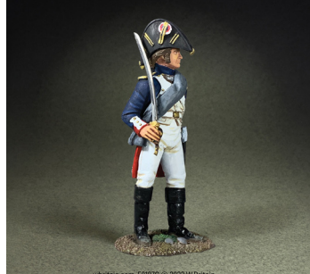
50107C $50 French Imperial Guard Company Officer with Bicorn, 1815