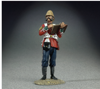
50099C $46 Back in Stock! 24th Foot Colour Sergeant Taking Roll, 1879