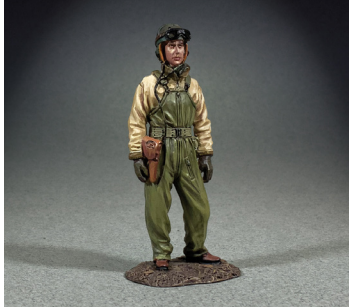
50124C $46 U.S. Tanker in Bib Overalls, 1941-45

See the entire collection of Club Exclusive Products online wbritain.com/collectors-club/wbcc-exclusive-product