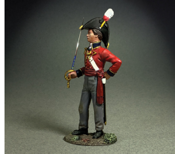
50122C $46 British 1st Foot Guards Company Officer, 1812-16