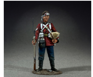
50113C $39 24th Foot Corporal with Bandaged Head Standing at Ease, 1879