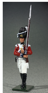
50116C $28 Coldstream Guards Grenadier Marching, 1792 Glossy Figure